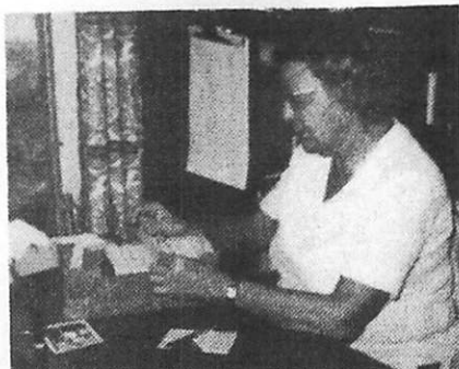
Volunteers man the library throughout the year.

In keeping with the nudist philosophy, the library is housed on the grounds of a bona-fide nudist park in a setting which provides any visitor, scholar, or library member a vivid reminder of our nudist identity with sunlight, fresh air, relaxation, and a oneness with nature.